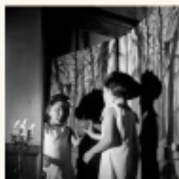
Miwa Yanagi, Snow White from the series Fairy Tale , 2004, gelatin silver photograph, Deutsche Bank Collection. © Miwa Yanagi