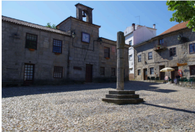
L: "Center of the Town of Belmonte—A Center for Crypto-Judaism—Apr 2011"